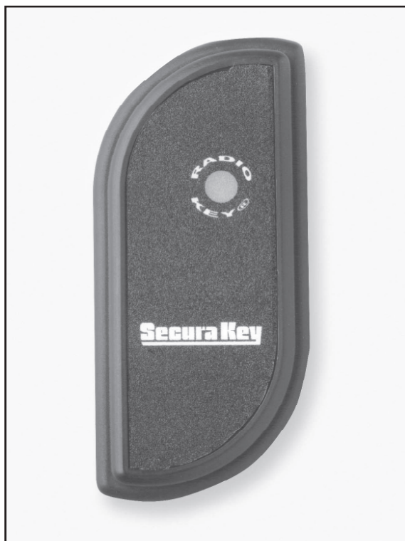
RADIO KEY ® RK-WM - ACTUAL SIZE

Radio Key ® RK-WM Proximity Reader is designed to integrate into any system requiring a Wiegand output. The reader will read Secura Key proximity cards or key tags and transmit the data in virtually any Wiegand Format up to 40 bits.