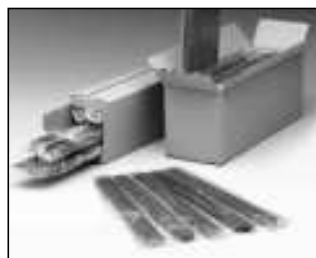
Bulk quantity models "Contractor & Master Cartons for large jobs and distribution"