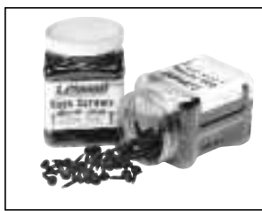
RSP-500 / RS-500 Jars

NEW RSR Robertson square head available!