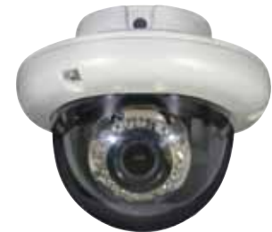
HD4DIRS shown without mounting ring for flush mount