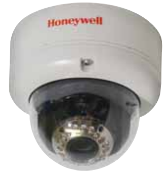
HD4DIRS shown with mounting ring for surface mount